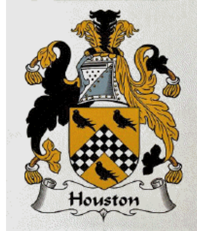
Houston Family Crest