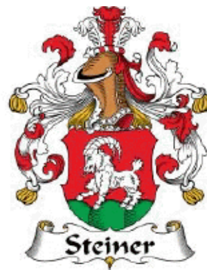
Steiner Family Crest