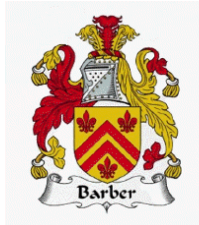
Barber Family Crest