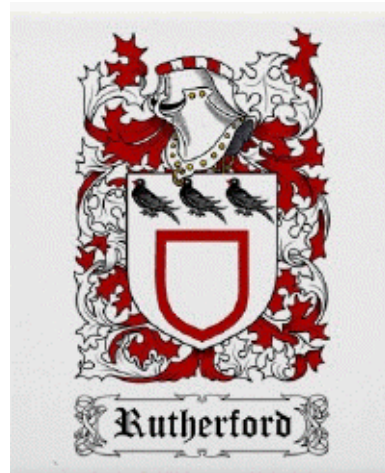
Rutherford Coat of Arms