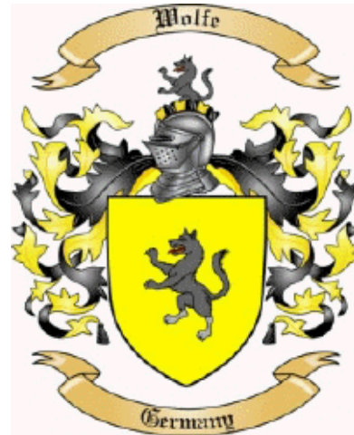
Wolfe Family Crest