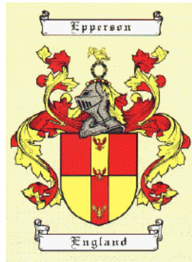
Epperson Family Crest