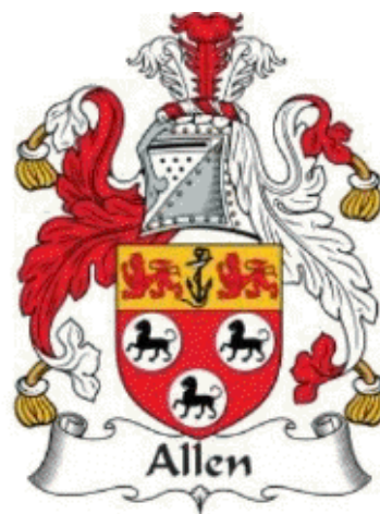
Allen Family Crest