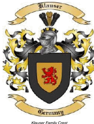
Klauser Family Crest