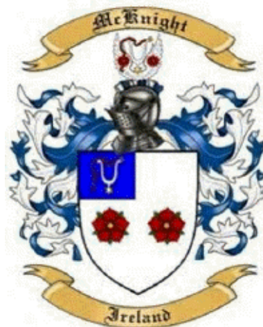
McKnight Family Crest