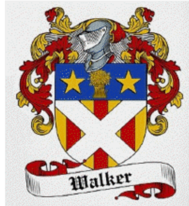
Walker Family Crest