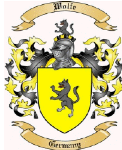
Wolfe Family Crest